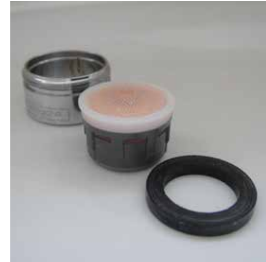
4: CHECK the components of your new tap aerator; the housing, the regulator, and a washer