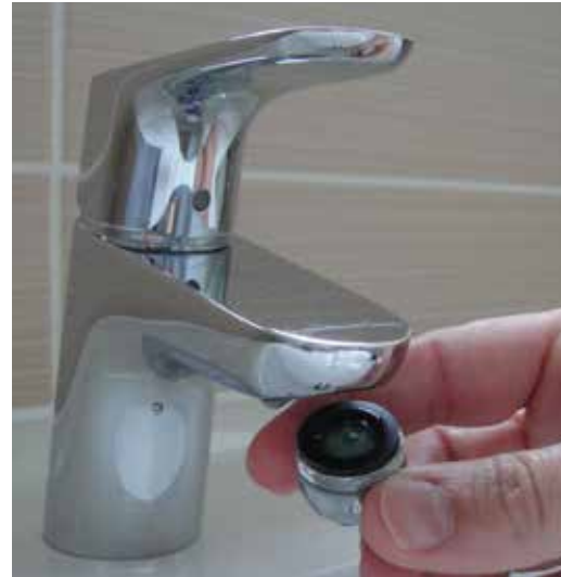
3: REMOVE the housing, discard the old filter if one was installed and clean away any limescale