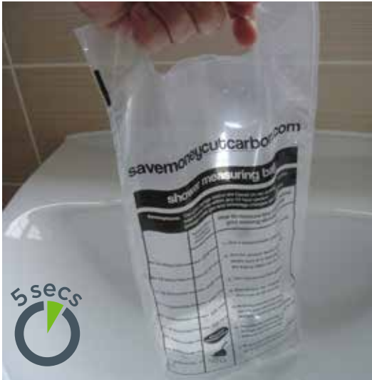
1: MEASURE your current flow rate with one of our easy to use flow bags