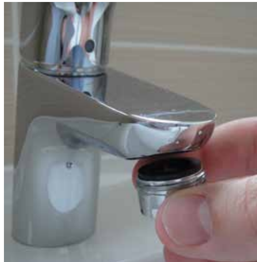
6: SCREW back onto the tap (being careful not to over-tighten), turn the tap on and check for leaks