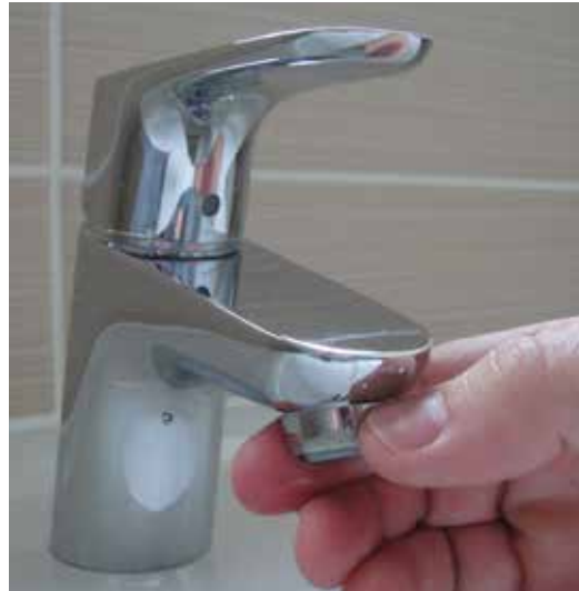
2: UNSCREW the end housing of the tap (you might need one of our special tools or a wrench if it's tight)