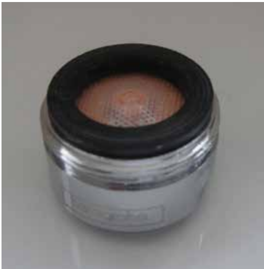
5: ASSEMBLE the regulator into the housing and loosely place the washer on top